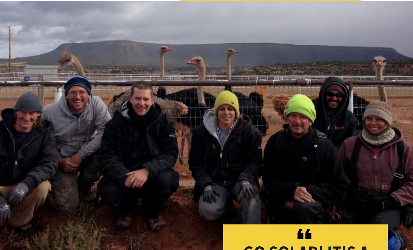
PHOTO: Tall Foods Ostrich Farm

Rural businesses and residents can take advantage of the many resources offered by the U.S. Department of Agriculture - Rural Development and the U.S. Department of Agriculture - Rural Development (USDA RD). Small businesses and agricultural producers are also eligible for USDA RD's Rural Energy for America Program (REAP). This program provides loans or grants to help finance energy efficiency and renewable energy projects for rural America. Tall Foods is a rural small business in San Miguel County that used the U.S. Department of Agriculture Rural Development's Rural Energy for America Program (REAP) grant to get as close to 100 percent renewable energy as possible. After going solar, their largest monthly bill during the summer was only $21.