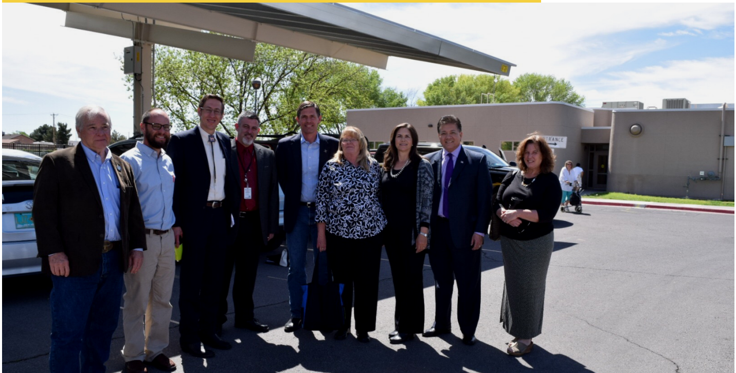
PHOTO: The City of Las Cruces completed a 280-panel solar parking structure at the Munson Center, one of many new solar projects in the community.

Over the past six years, the City of Las Cruces has invested $5 million in almost 1.2 megawatts of solar projects at nine different facilities. These renewable energy investments represent almost 7 percent of the City's energy portfolio, garnering over $300,000 annually in energy savings and renewable energy credits. Initially, the City utilized grants and loans from the Department of Energy, and Housing and Urban Development, and the New Mexico Finance Authority. As solar costs decreased, the City administration and the council recognized that the City Council could shift the trajectory of increasing energy costs and anticipated capital needs by using Hold Harmless/Gross Receipt Tax money for sustainable energy projects. Local governments in New Mexico are leading the way while saving taxpayer dollars.