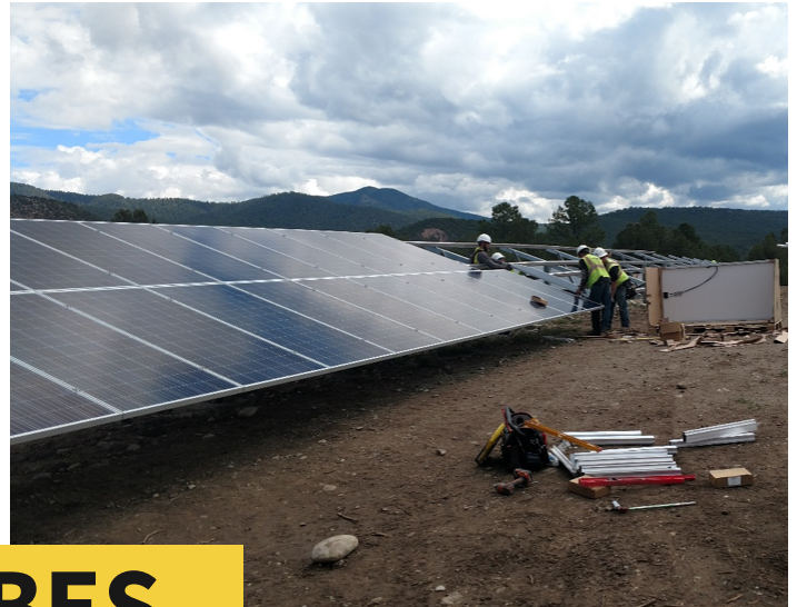
PHOTO: Picuris Pueblo Solar System