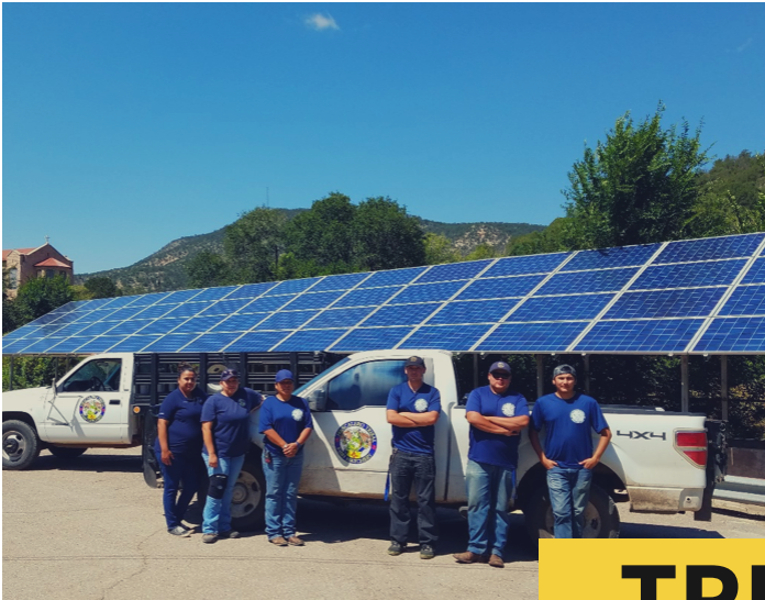
PHOTO: Mescalero Tribal Fish Hatchery Solar System