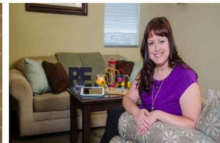
The Family Connection - Albuquerque