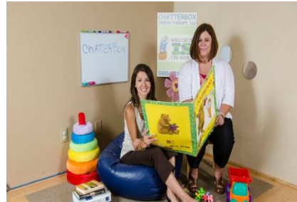
Chatterbox Speech Therapy, LLC - Albuquerque