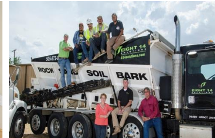
Eight 14 Solutions - Albuquerque