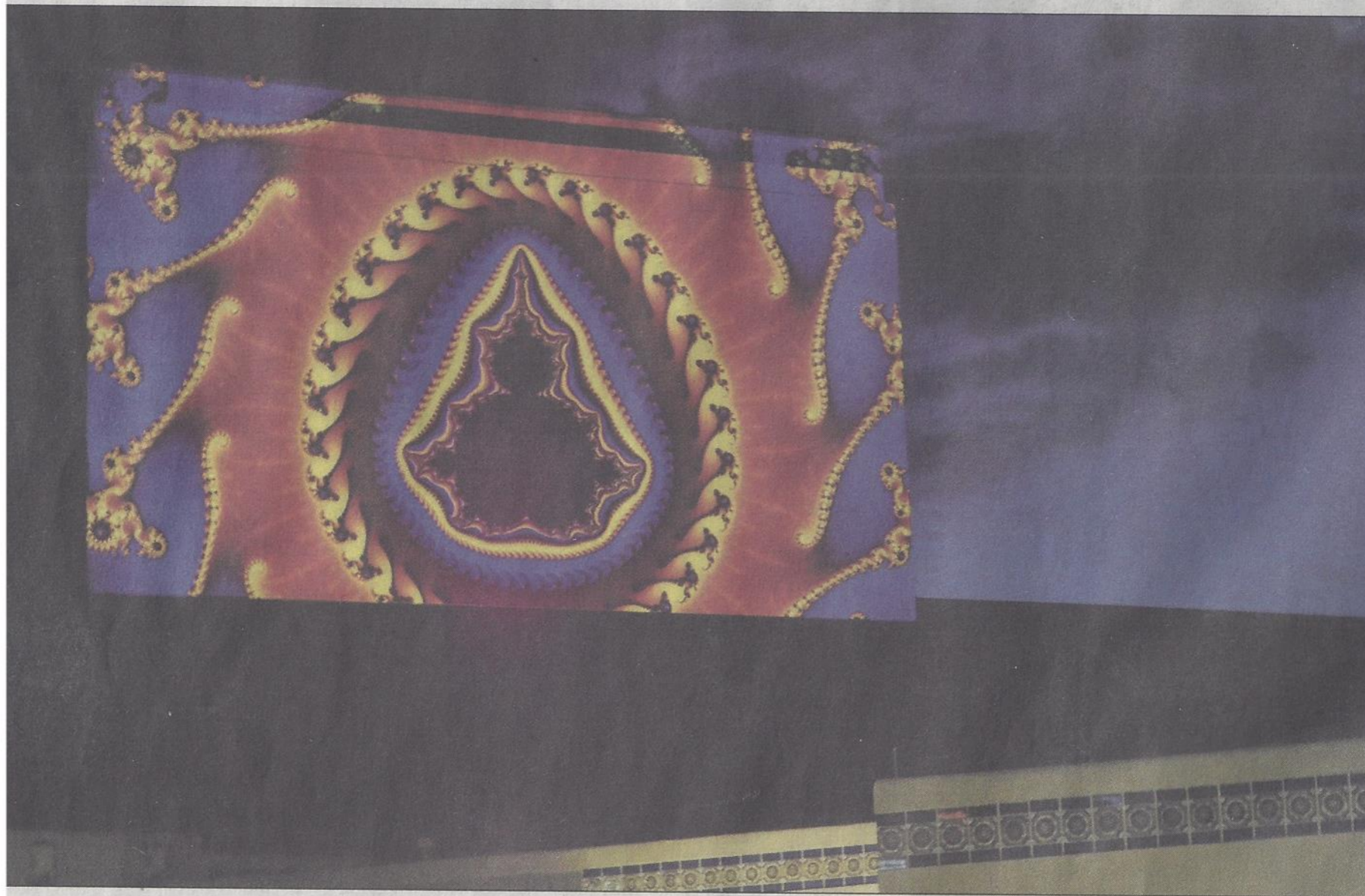
Northern New Mexico College's new digital mural displayed on the Center for the Arts building on Sept. 3.