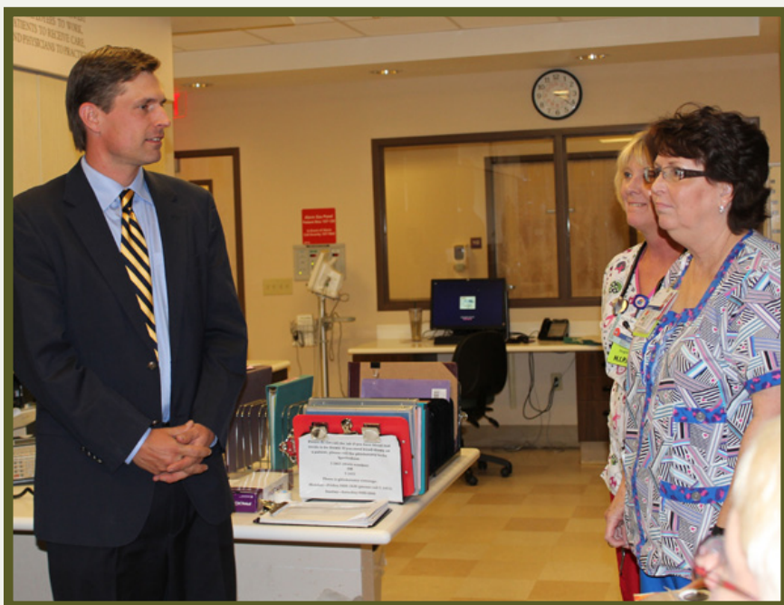
U.S. Senator Martin Heinrich receives a briefing at Lovelace Women's Hospital about new programs to promote early cancer screening and health care enrollment