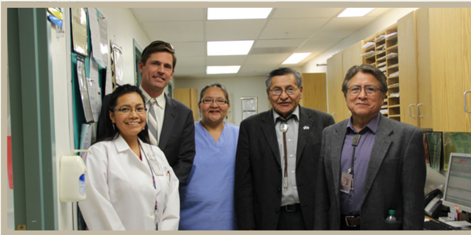
U.S. Senator Martin Heinrich tours the Gallup Indian Medical Center with Navajo Nation President Ben Shelly and hospital staff.