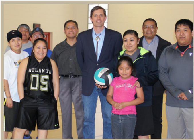
U.S. Senator Martin Heinrich tours the Zuni Wellness Center, which provides a comprehensive program for fitness services, health promotion, and diabetes prevention for youth and adults.